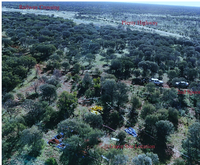
Grave site 120 km north from Alice Springs off the Plenty Highway