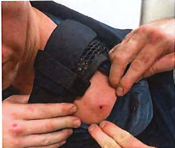
Injury sustained by Rolfe as photographed by Hawkins

EBERL: But I never – never mentioned it to anyone other than the other day, but um –